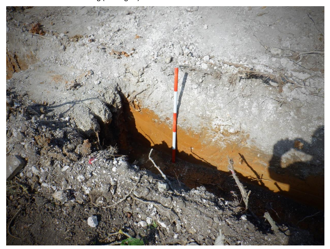
Plate 4. Section of trench