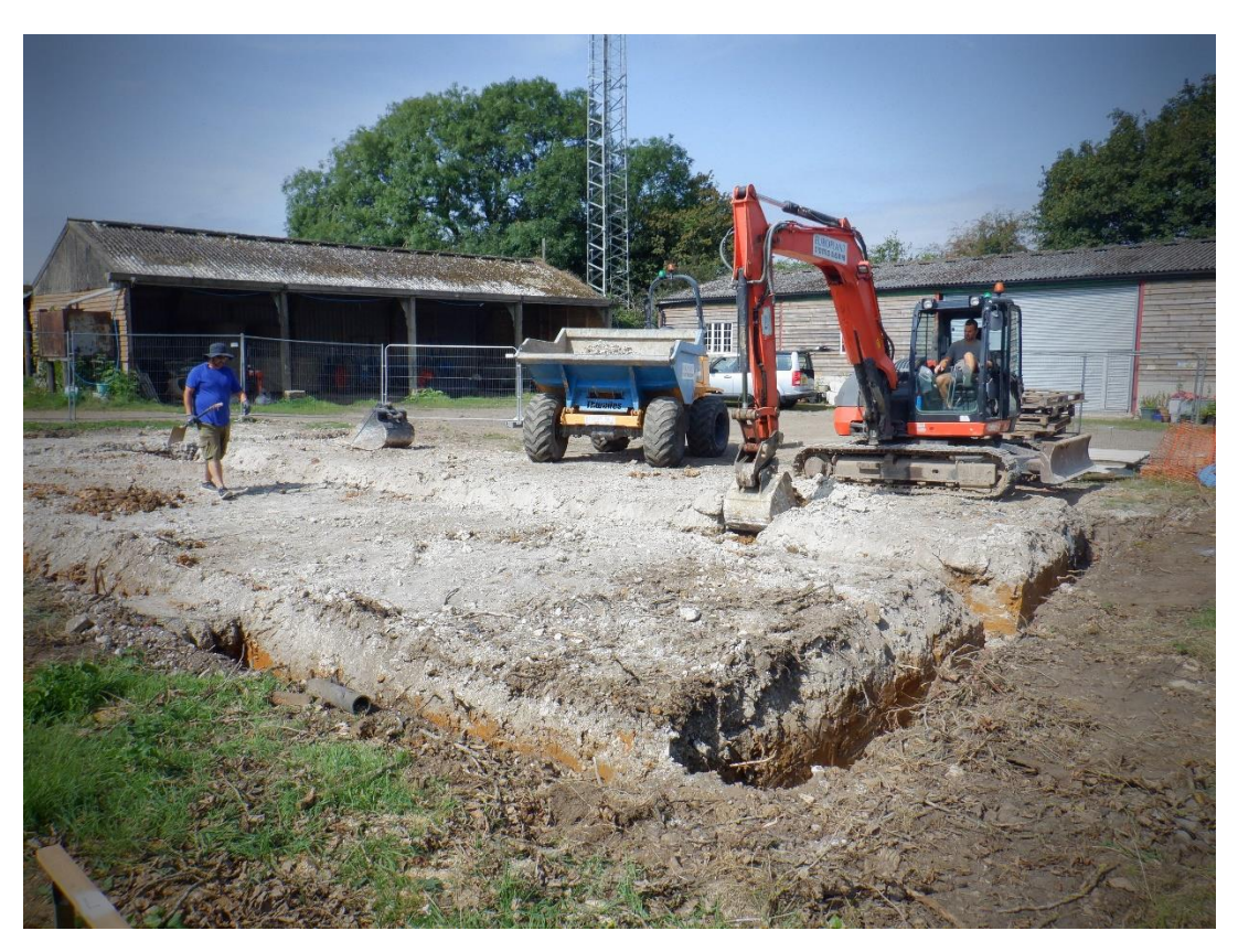
Plate 5. Foundation trenches (looking East)