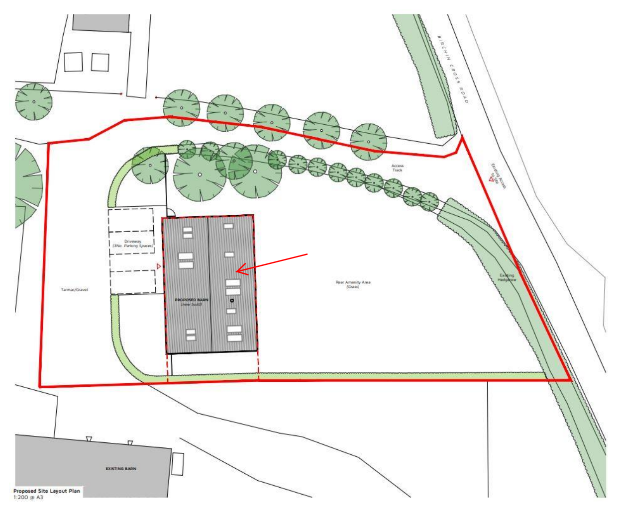
Figure 3. Proposed development and area watched (red dotted line)