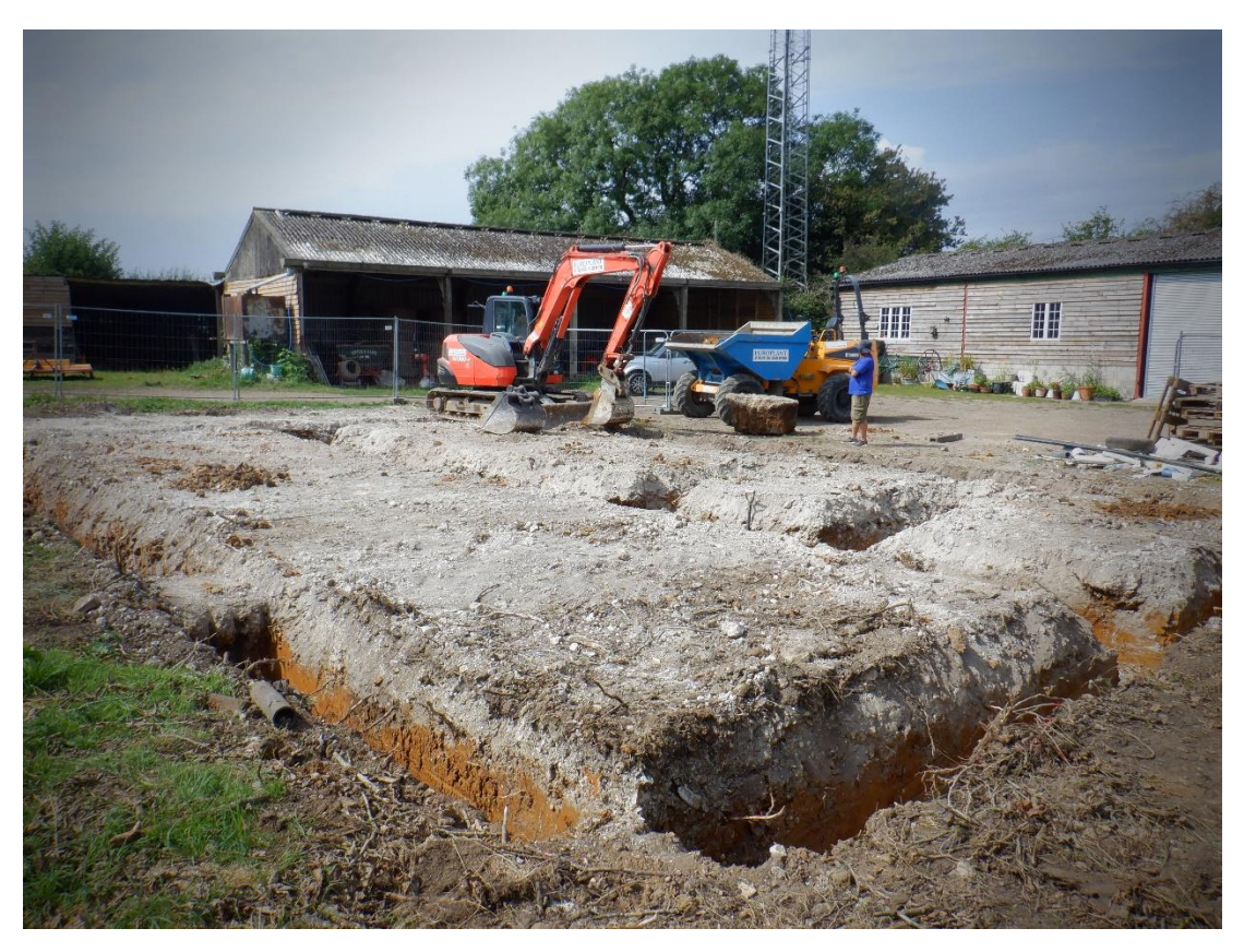
Plate 3. Foundation trenching (looking SE)