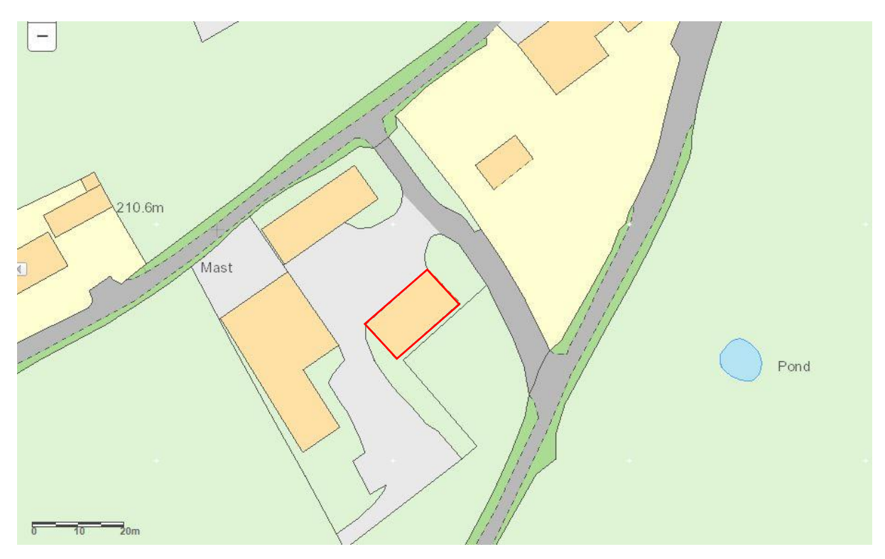
Figure 2. Proposed area of development (existing buildings to be demolished and area of proposed build (red line))