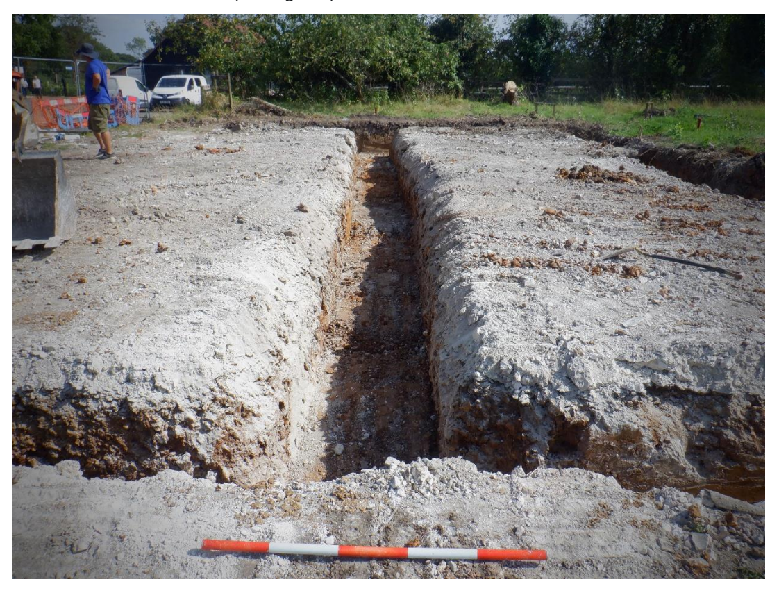
Plate 6. Foundation trenches (looking SE)