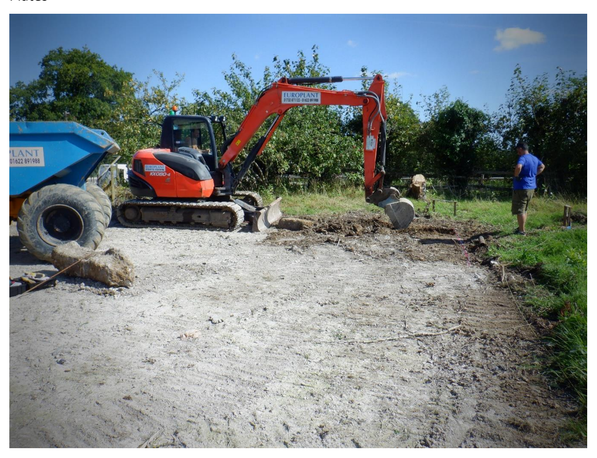
Plate 1. Removing grass and topsoil surfaces (looking SE)