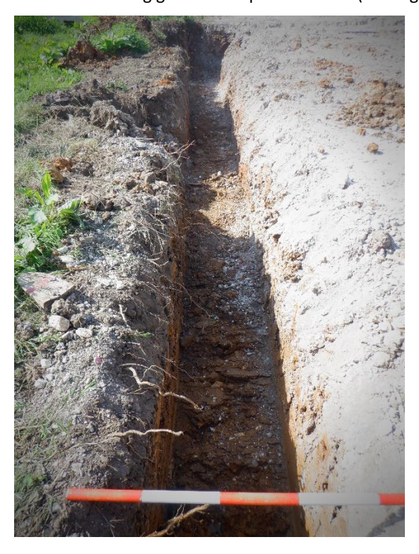
Plate 2. Initial trenching (looking NNW)